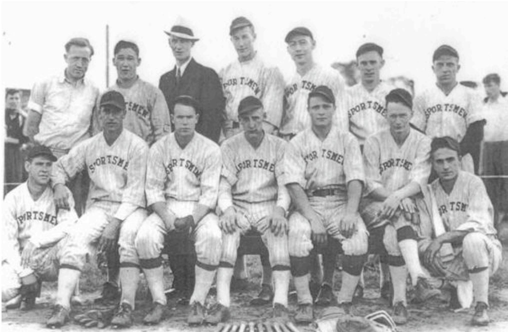
Baseball in the 1940's.