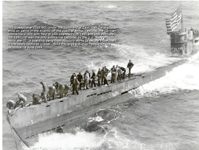
The U-505 Submarine being captured in the Pacific (June, 1944).