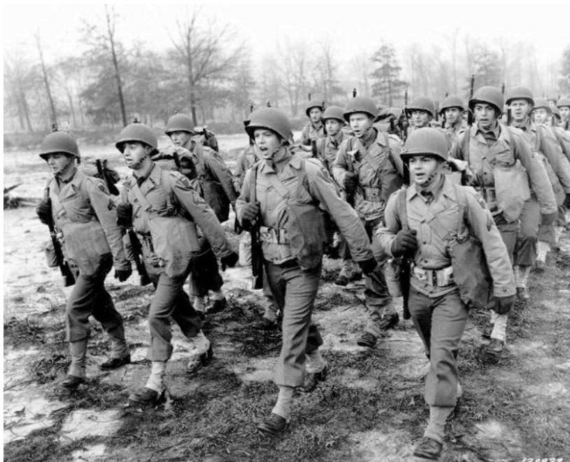
American soldiers fighting in the Pacific in World War II; many of them only 18 years old.

World War II Audio Clips Library. Listen to audio clips from actual radio programs during World War II. http://www.bbc.co.uk/schoolradio/history/worldwar2audioclipslibrary.shtml