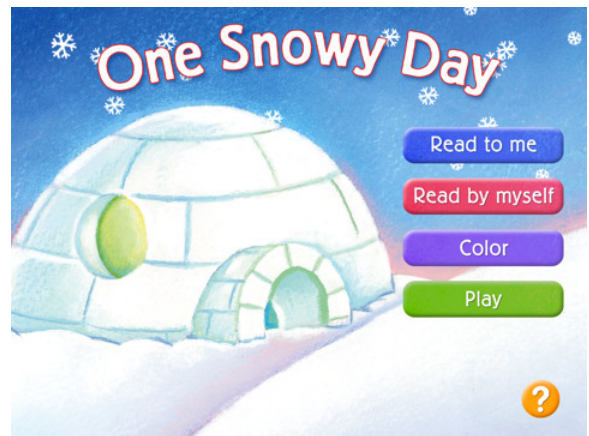
One Snowy Day Apple iPad