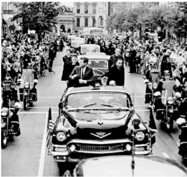
The Kennedy Detail Enhanced Edition Kindle

A book is a published collection of connected pages, screens, or materials.